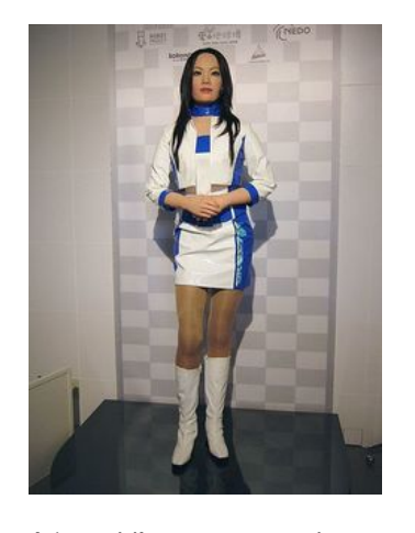
A 'gynoid' customer service robot in female form.

should they have a narrow and unreflective morality? It's one thing to have a conversation and conclude something about the development of technology; it's another to demand silence before anyone has had the chance to speak.