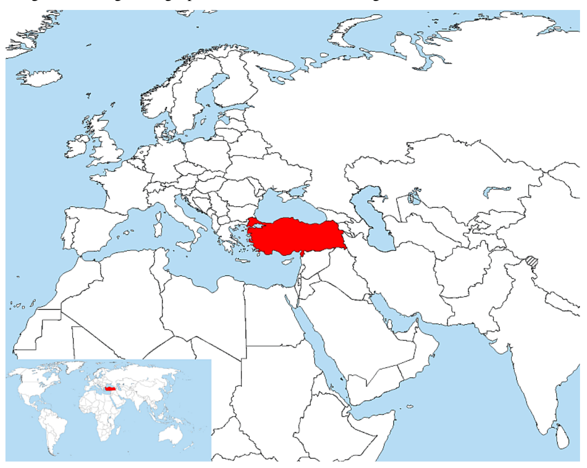
Map of Turkey between Asia and Europe. 538

develop itself further. The ever increasing energy needs of the West came as a saviour in the 1990s and then again in the 2000s as Turkey began to promote itself as an energy bridge so as to regain its geopolitical role which was thought lost after the Cold War.