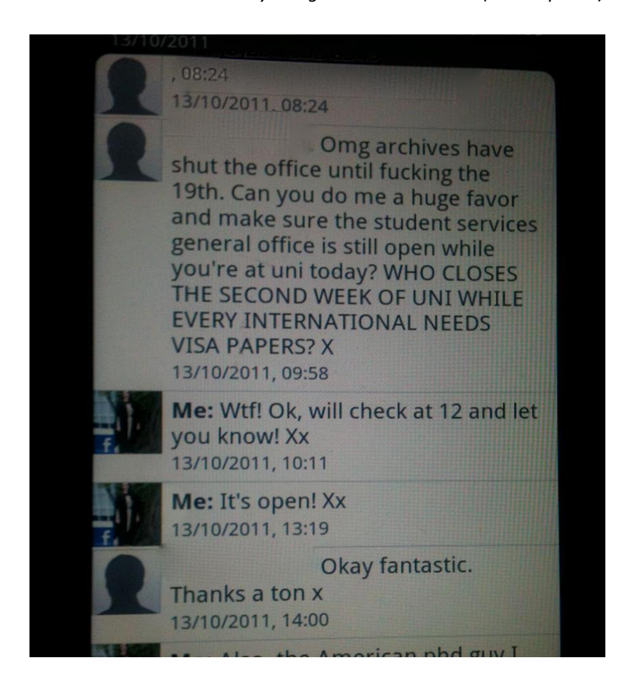
Figure 3: Mobile Communication (Feedback Seminar)

'How does one study using electronic books?' (Box response)