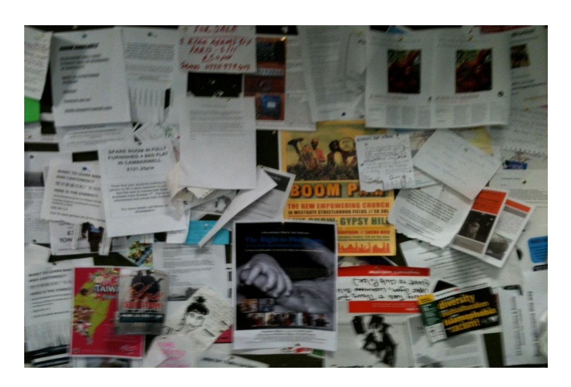
Figure 4: Flyers (Feedback Seminar)

Another student had taken a similar photograph of the corridors but this time the flyers had all been cleared away from the walls (Figure 5, below). This was also discussed as indicative of a sense of isolation and loneliness at the university felt by the students in the feedback seminar and the lack of control that they felt they had over the spaces of the university: since they were unable to put up flyers or posters without following certain procedures they did not feel that they owned or were part of the space. Such issues also relate to my discussion in Chapter Three, regarding the interactions that Karen (a student collaborator) and I had with the university security services when attempting to engage in arts-based research in the building. As stated, the security guard suggested that 'official clearance' was required in relation to putting up posters, or in this case research boxes, at Woodlands: