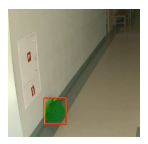
Figure 1: A suspicious item of luggage:

The "IF-THEN" rules provided the algorithmic basis for relevance detection. The development of "IF-THEN" rules, and the decision to focus on 3 areas of relevance detection, also provided an initial insight into the account-able order of the algorithmic system. In the immediate project setting, the order emerged through collaborative decision making between computer scientists from Universities 1 and 2, networking experts from TechFirm and representatives from StateTrack and SkyPort. Collaborative work also invoked a future account-able order of airport and train station interactions between the operators of the system and passengers and their luggage. The future everyday competences of the system operators involved in securing the space of the train station and airport were opened for discussion around the "IF-THEN" rules. The rules provided a basis for discussing future occasions where operators would be provided with data on which decisions would be made regarding, for example, suspicion.