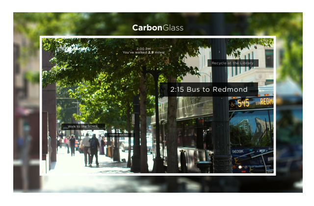
Fig. 4. Carbon Glass: Reducing your carbon footprint

(where many individuals collect from a single distribution center), and hub-and-tree structures (where there is a centralized distribution point from which one or more distribution trees arise). Each of these structures is appropriate for different kinds of exchange, and would benefit from different kinds of ICT support.