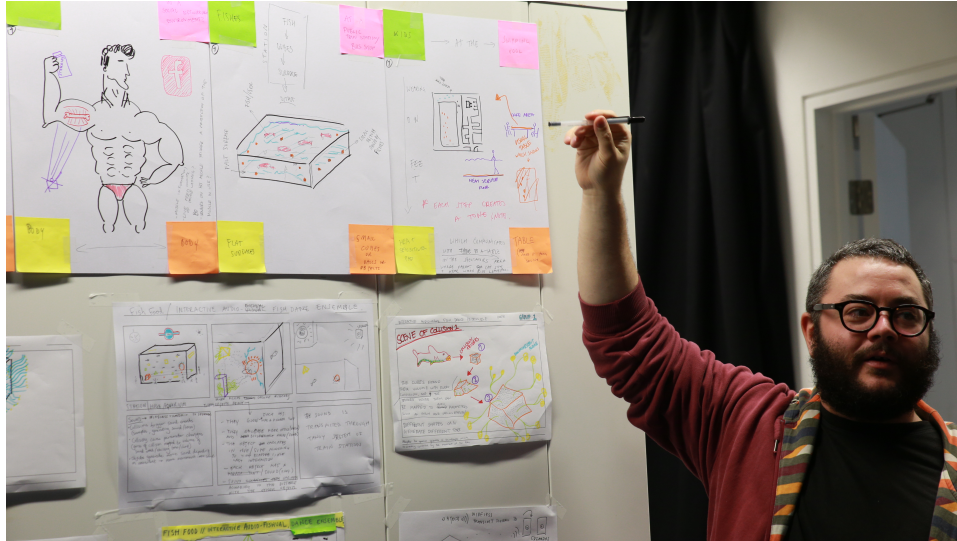
Fig. 1. Bootlegging presentation