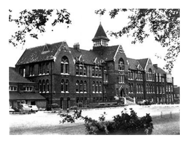
Fig. 0.1. Hackney Downs School

The Clove Club, founded in 1884 to keep the 'old boys' of Hackney Downs Boys Grammar School connected, represents this past-tense golden age. Hackney Downs occupied Mossbourne's site before its closure in 1995 and their website showcases a nostalgic narrative of their alma mater's 'good old days', evidencing the complicated struggles over race and class, multiculturalism and assimilation that continue to affect Britain's social landscape (CC, 2013). The site showcases images of the school's heyday throughout the 1940s, 50s and 60s: boys in gleaming cricket whites play on the Downs; a bespectacled, smiling science teacher wearing a lab coat brandishes a pipe in one hand, a beaker in the other; the Hackney Cadet Corps marches with drums against the backdrop of the Pembury Estate. A 222-page virtual book of 'success stories' catalogues the lengthily list of notable graduates. The school motto 'God grant grace' is printed across the title page of the 1958 royal blue hymn book, its preface describing the school's 'special needs' due to hosting Christian and Jewish communities in a common assembly.