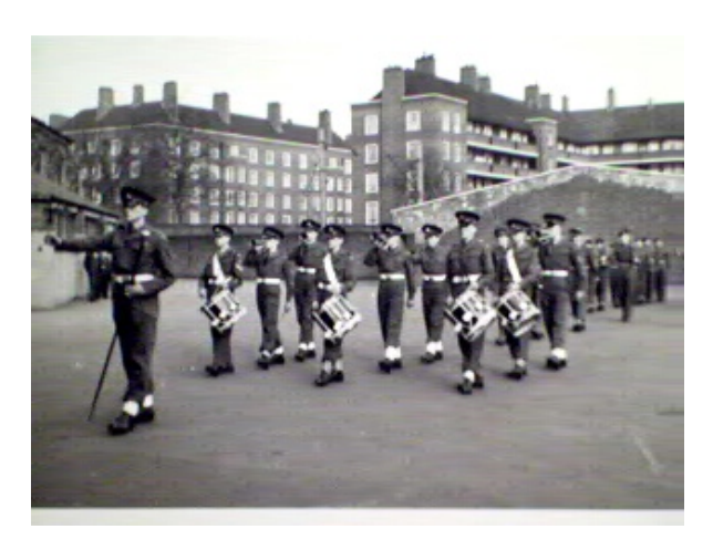
Fig. 0.2. Cadets practice against the backdrop of Pembury Estate in the 1950's