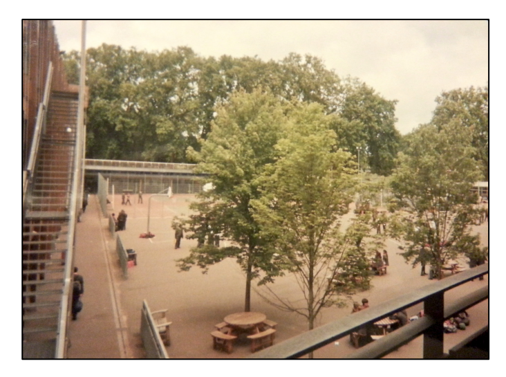
Fig. 0.5. View of the playground from the centre of the 'V'